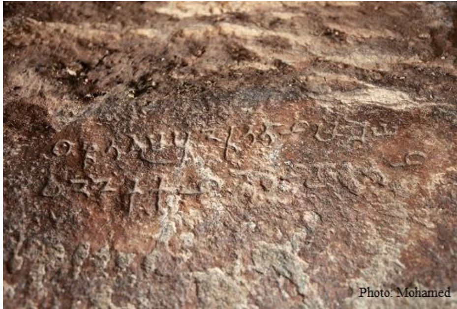
Fig 11: Tamil Brahmi inscription, Arachallur

The term maniyavannakkan refers to gemstone tester.