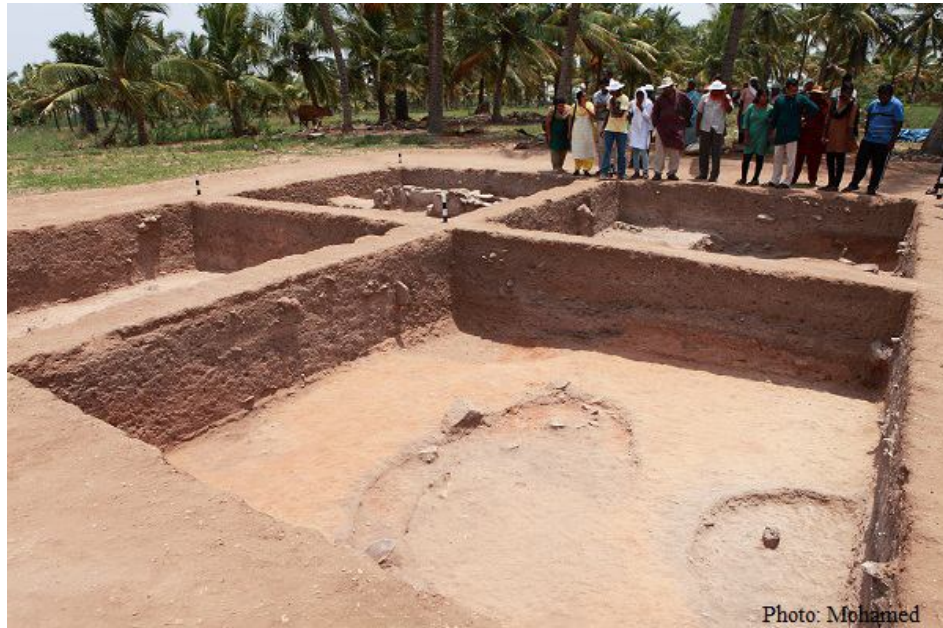
Fig 1: Trenches 2012, Kodumanal habitation mound

excavations were drawing to a close and the excavators had left key features and artefacts in situ for the benefit of the visitors. The habitation mound covers an area of 50 acres.