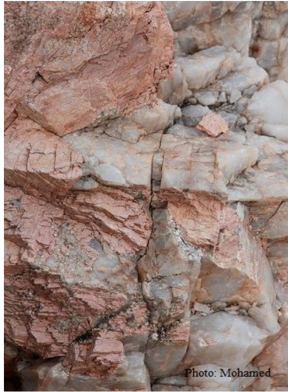
Fig : Quartz and feldspar formations, Arasampalayam