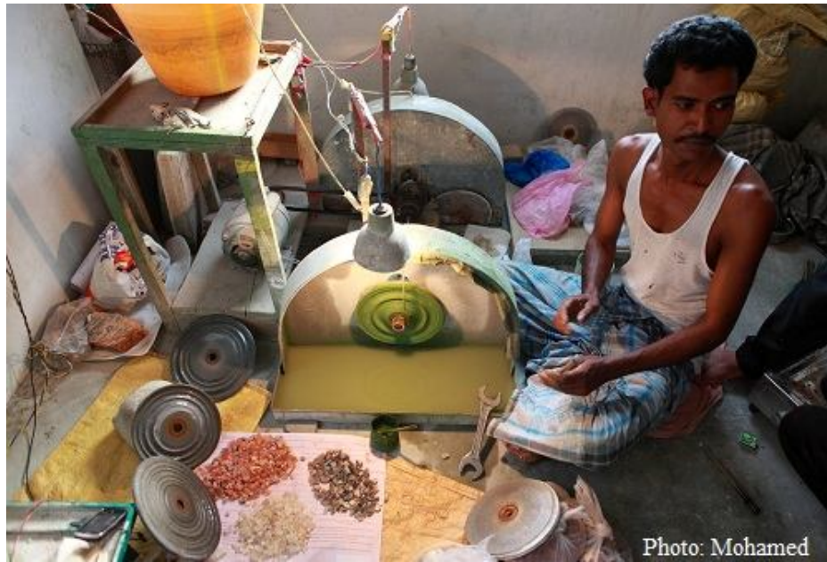
Fig 15: Bead making, Kangayam

The raw material used are blocks of moon stone (gray/red/white) purchased in blocks of about 20 *20*20cms. This does not appear to be a preset size. Babu explained that gem stone- cutting and polishing is a traditional occupation and that the use of electricity is a recent innovation. The basic machinery has remained the same over the years. The machine is a simple one that allows a series of wheels to be put on a peg and turned. (See fig 15) These act as polishers. The same machine also has facility to apply mechanical force to break the raw material into pieces of a desired size. The raw material is first broken into rectangular pieces almost double the size of the intended inlay. The rough out of the inlay is obtained by smoothing of the corners and edges on a turning wheel. Five wheels are used in a series to shape out and polish a single bead. These wheels can be of stone or metal. To attain lustre a green powder obtained from the market is applied on to the surface of the last wheel. Once the rough out of the inlay is obtained, it is fixed on to a pencil- sized reed using arrak (glue) before further polishing is done.(see fig 16) This is for convenience. Once the rounded side is smoothed, the bead is loosened from the end of the reed and the smoothed side is fixed on to it so that the flat side can be polished. Once the polishing is done the bead is washed in