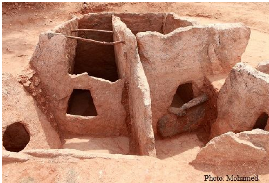
Fig 7: Port holes, Megalith XV, Kodumanal 2012

This season a transepted cist (Megalith XV) (N 11006.771' E77031.492') was excavated by the team see (fig 6). Dr. Rajan suggested that the common pattern found in the case of transepted cists in the area is for the South-facing chamber to have a keyhole shaped port hole and the North facing ones to have round shaped and the east facing chambers to have a trapezium shaped port hole. (See fig 7). In the North- West corner of Megalith XV, a sword was found kept in a crossed position along with an arrowhead. Each of the chambers was originally covered with individual capstones.