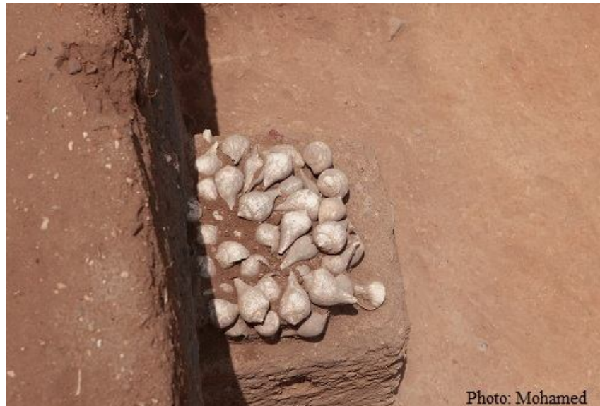
Fig 3: Conch shell cluster in situ, Kodumanal 2012