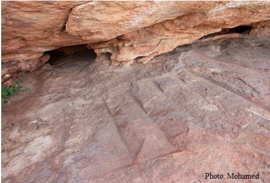
Fig 12: Rock beds, Pugalur

Inscription 1: (N 11 0 04.447' E77 0 59.960'') Karur ponvanikan nantiyadithanam : bed dominated by Karur gold trader nanti.