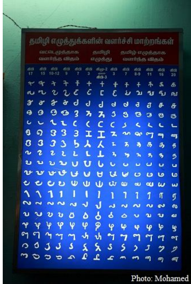
Fig 9: Evolution of Tamil Brahmi script, Archaeological Museum, Karur

Most of these inscriptions date from 3 rd century BCE to 3 rd Century CE. The dating of the inscriptions are based on the stylistic changes. The early form of Tamil Brahmi is more angular in nature and progressively becomes cursive. (see fig 9) The vertical lines that go up in the earlier style also come down or curve down in the later periods. All the 127 inscriptions have Jain associations even though they do not explicitly propagate Jain philosophy. They are mostly names of the donors and their place names. The donors include specialist traders of ploughshare, gemstone, textiles etc.