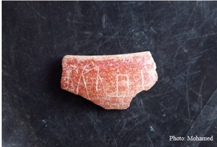
Fig 5: Sherd with Tamil Brahmi script, Kodumanal 2012

The burial area is to the East and North of the habitation area and has a spread of 100 acres. Dr. Rajan is of the opinion that the earlier burials must have been located in the eastern part and it later spread to the South.