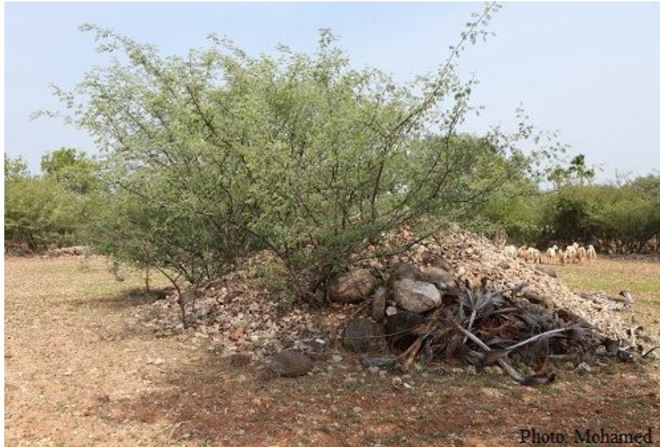
Fig 14: Cairn Circle, Karattu palayam