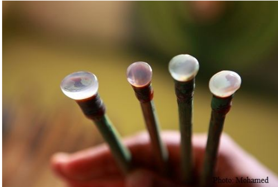
Fig 16: Beads fixed on to reed for polishing, Kangayam

warm water detergent. On an average a single bead requires 25-40 minutes of labour. They are sold at around Rs. 150 per bead