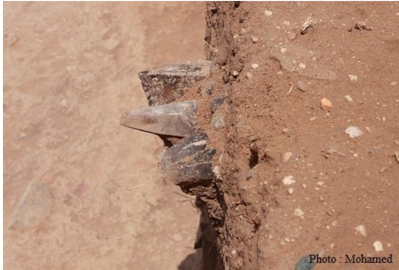
Fig 2: Quartz crystals in situ, Kodumanal 2012

This season in the habitation area, four trenches (see fig 1) (N 11 0 06.645' E 77 0 31.360') were laid separated by baulks. The total deposit is of one meter and has three different floor levels. The trenches, Dr. Rajan explained, gave evidences of quartz working and shell working and remains of a furnace fixed with clay were found. Pieces of quartz (worked ?) could be seen close to the surface level. (see fig 2). A cluster of conch shells mixed with bangle pieces of conch were also unearthed (see fig 3).