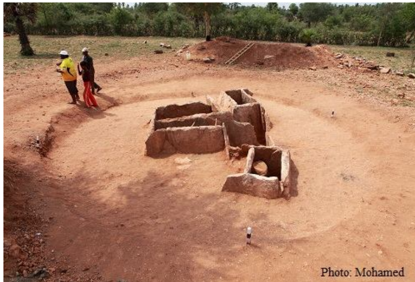
Fig 6: Megalith XV, Kodumanal 2012

The burial area is to the East and North of the habitation area and has a spread of 100 acres. Dr. Rajan is of the opinion that the earlier burials must have been located in the eastern part and it later spread to the South.