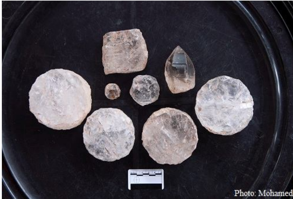
Fig 8: Worked quartz from Kodumanal

Site 2: Arasampalayam (N11 0 03.548' E77 0 31.431'")