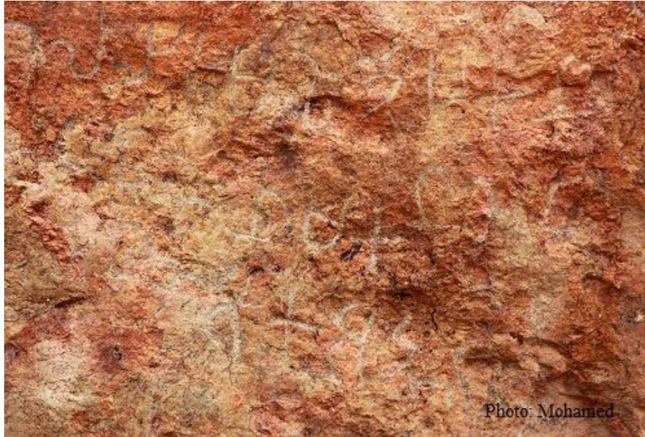
Fig 13: Tamil Brahmi inscription, Pugalur

Inscription 3 : is in a cave facing east. (details to be looked at )