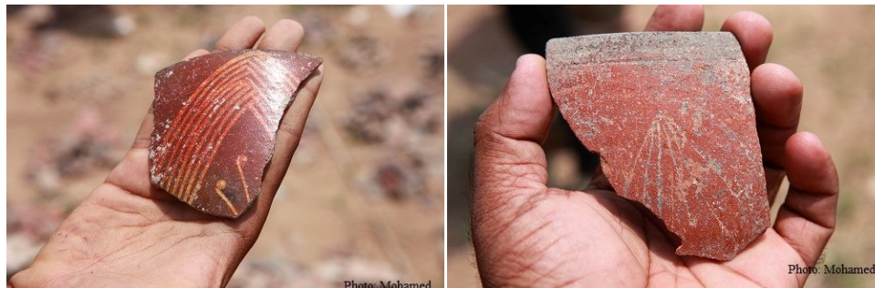
Fig 4: a. RCPW sherd, b. sherd with graffiti, Kodumanal 2012

in the soil. A large number of sherds have graffiti marks on them (see fig 4.b)